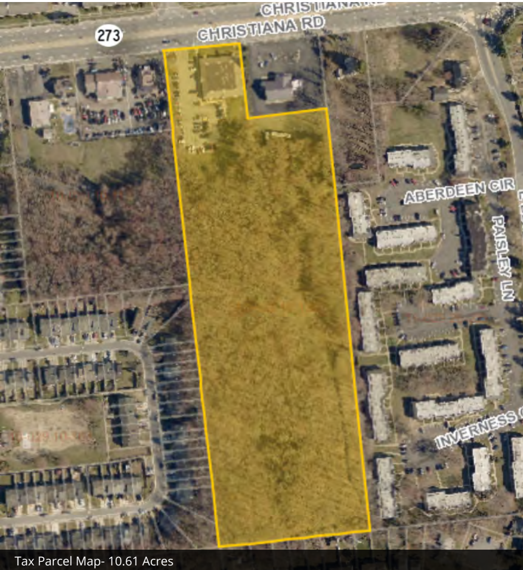
Tax Parcel Map- 10.61 Acres