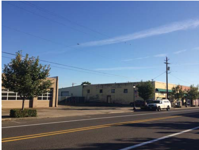
Views From Oregon Avenue