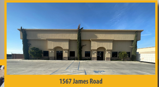
1567 James Road

1567 James Road - Suite A - Bakersfield, CA