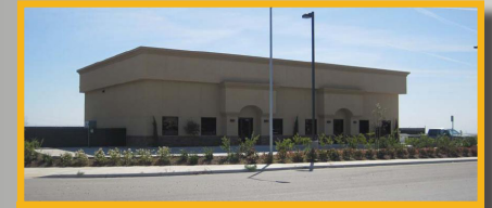
1567 James Road

1567 James Road - Suite A - Bakersfield, CA