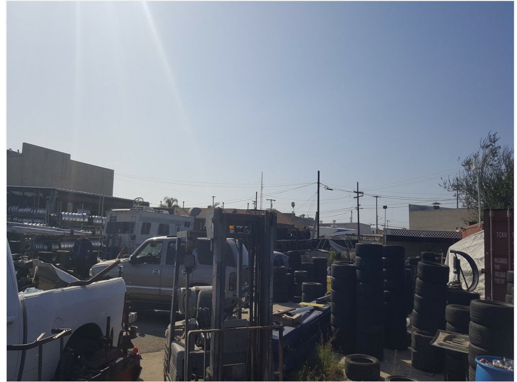
Outdoor Storage/Fenced Yard