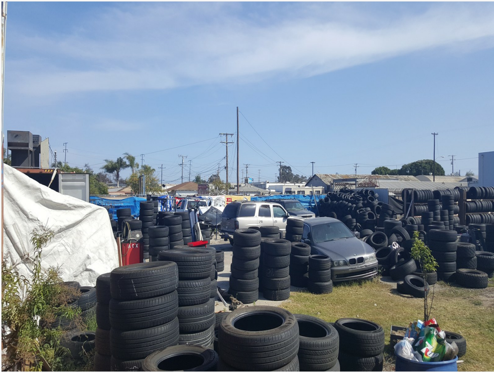
Outdoor Storage/Fenced Yard