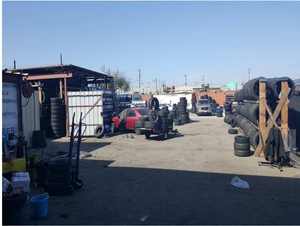
Outdoor Storage/Fenced Yard