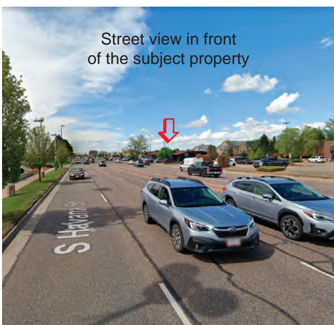
Street view in front of the subject property