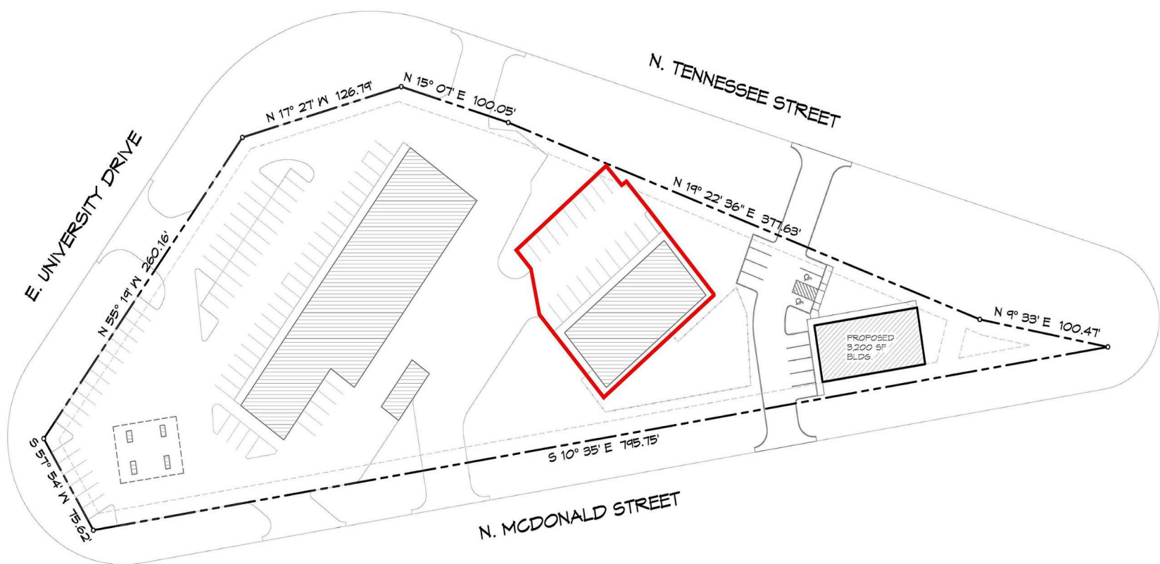
1 SITE PLAN NORTH SCALE: 1" = 80'-0"

Jon Cox Agent 972-632-5046 joncox@careycoxcompany.com