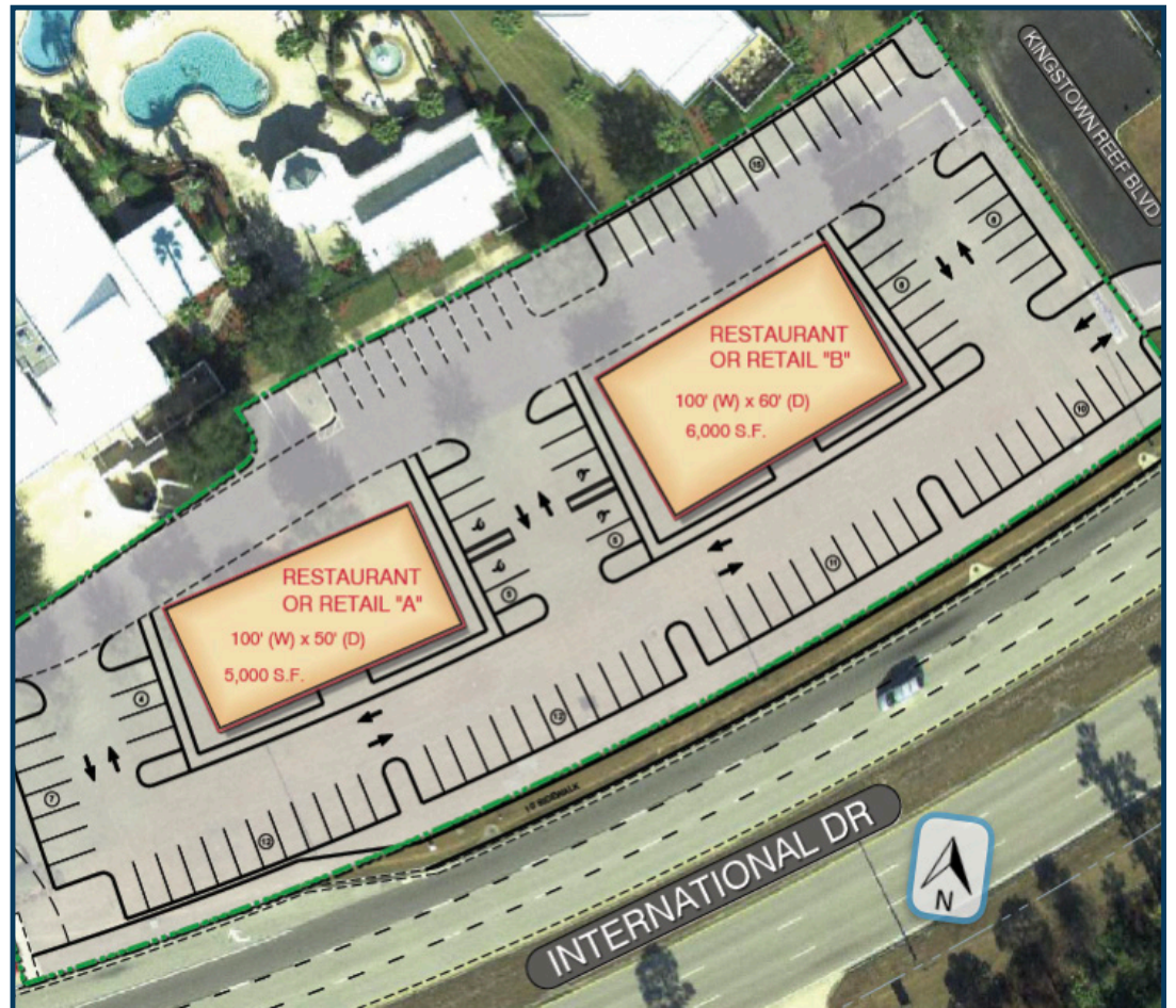
CONCEPT SITE PLAN