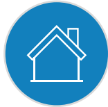
NUMBER OF HOUSEHOLDS