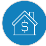
AVG. HOUSEHOLD INCOME