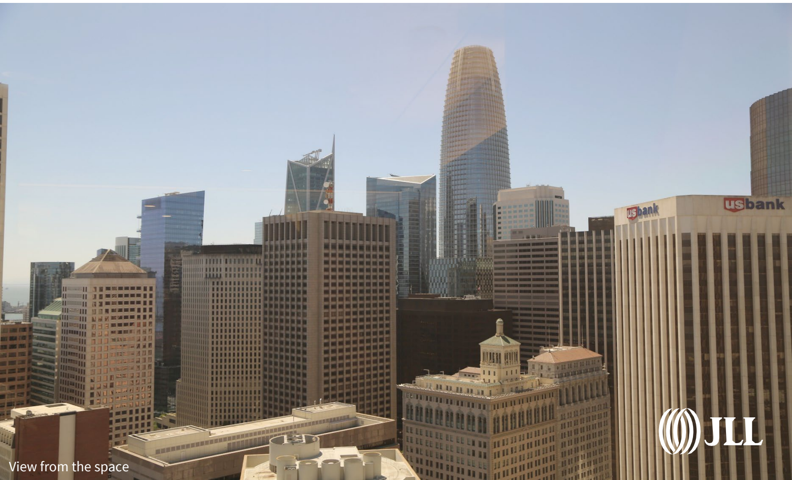
View from the space