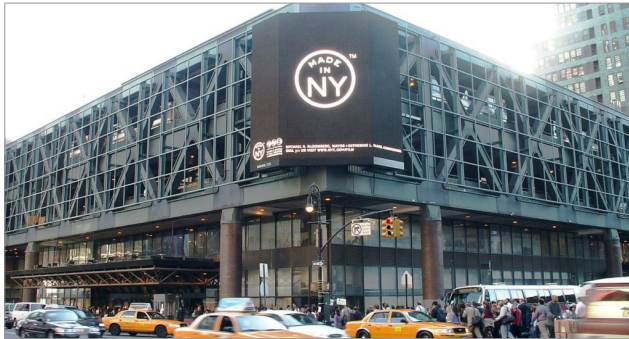
PORT AUTHORITY - 42ND STREET

BETWEEN 38th & 39th STREETS HELL'S KITCHEN