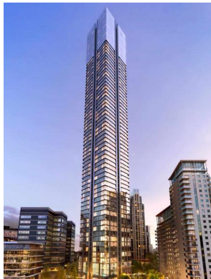
CGI of the new development (under construction)