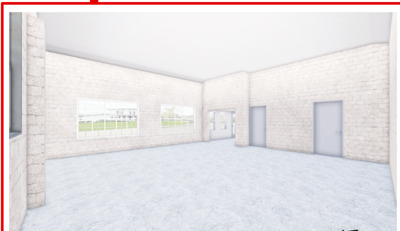
401 Loveland Ave - Interior Perspective