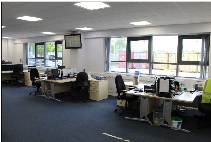
Ground Floor Office

A car park to the front provides circa 50 spaces, with an additional 5 spaces in the secure service yard, which has a maximum depth of approximately 50m.