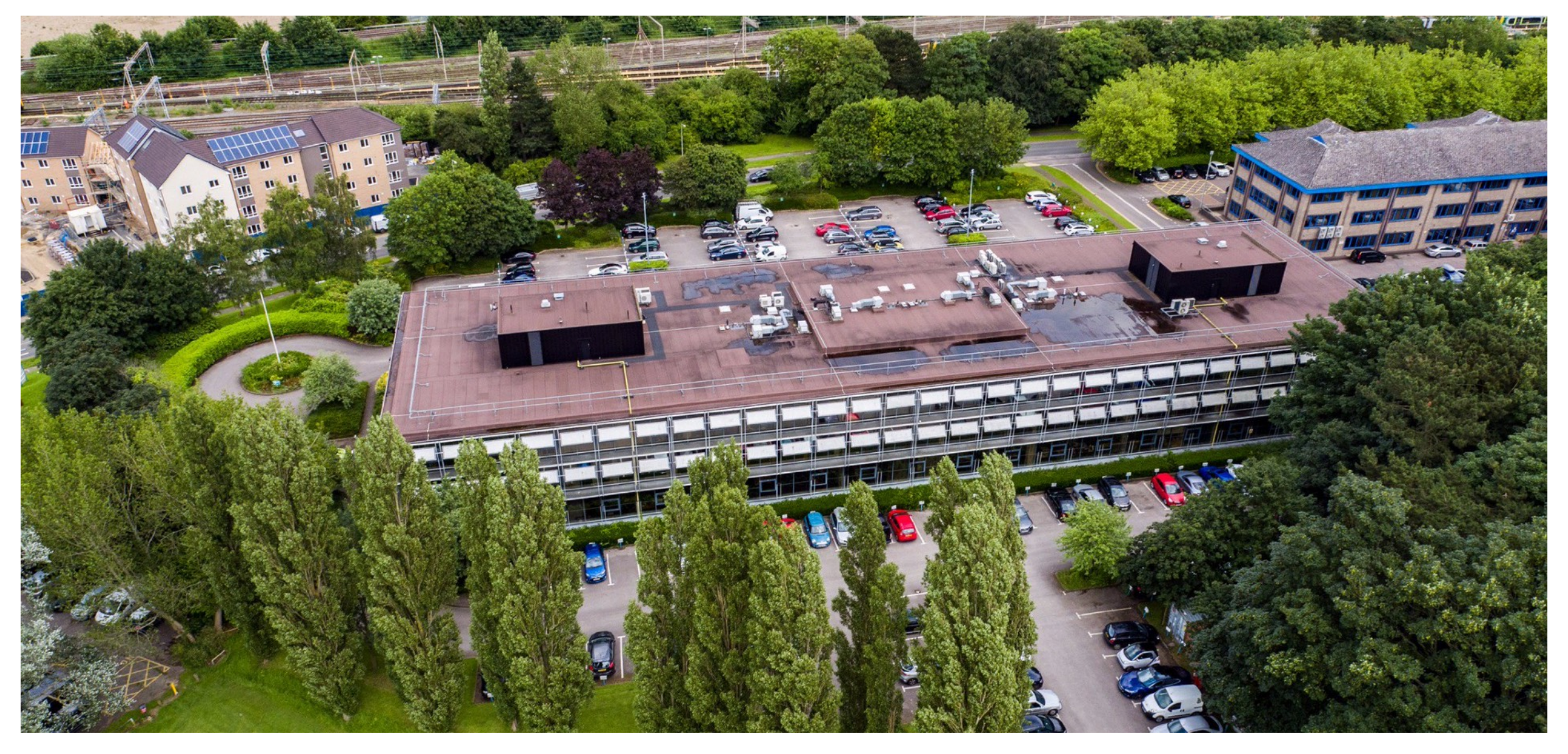
Challenge House is located next to the green and pleasant surroundings of Bletchley Park.

Challenge House is very accessible by road and public transport and there are plenty of amenities nearby.