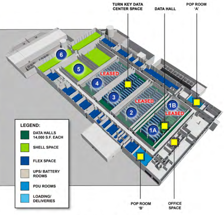
SECOND FLOOR LEVEL