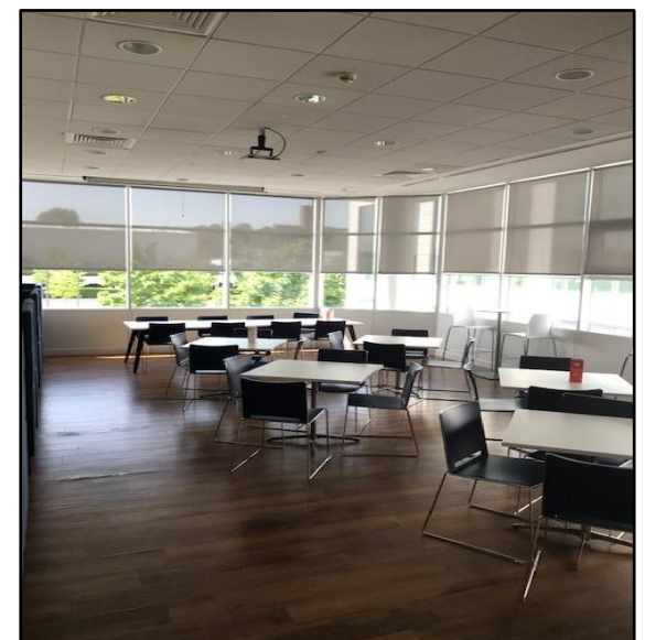
Office space to be refurbished