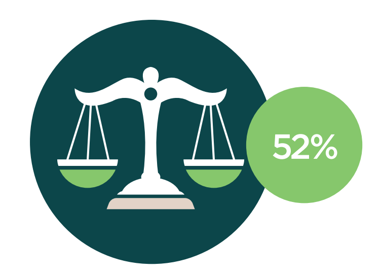
Household income 52% above national average