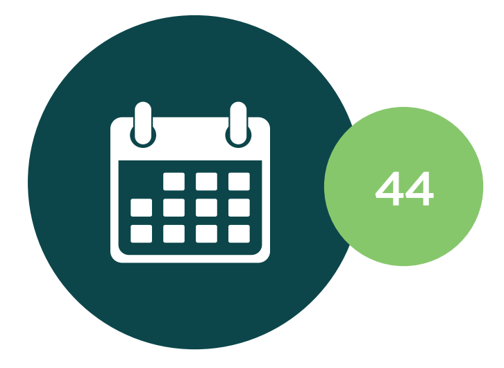
Visit Frequency 44 visits per annum