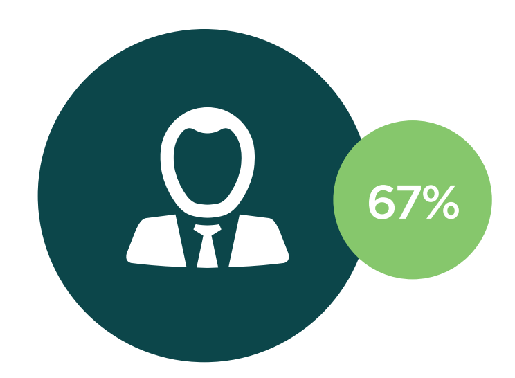
SEG Profile 67% ABC1 (26% above the UK average)