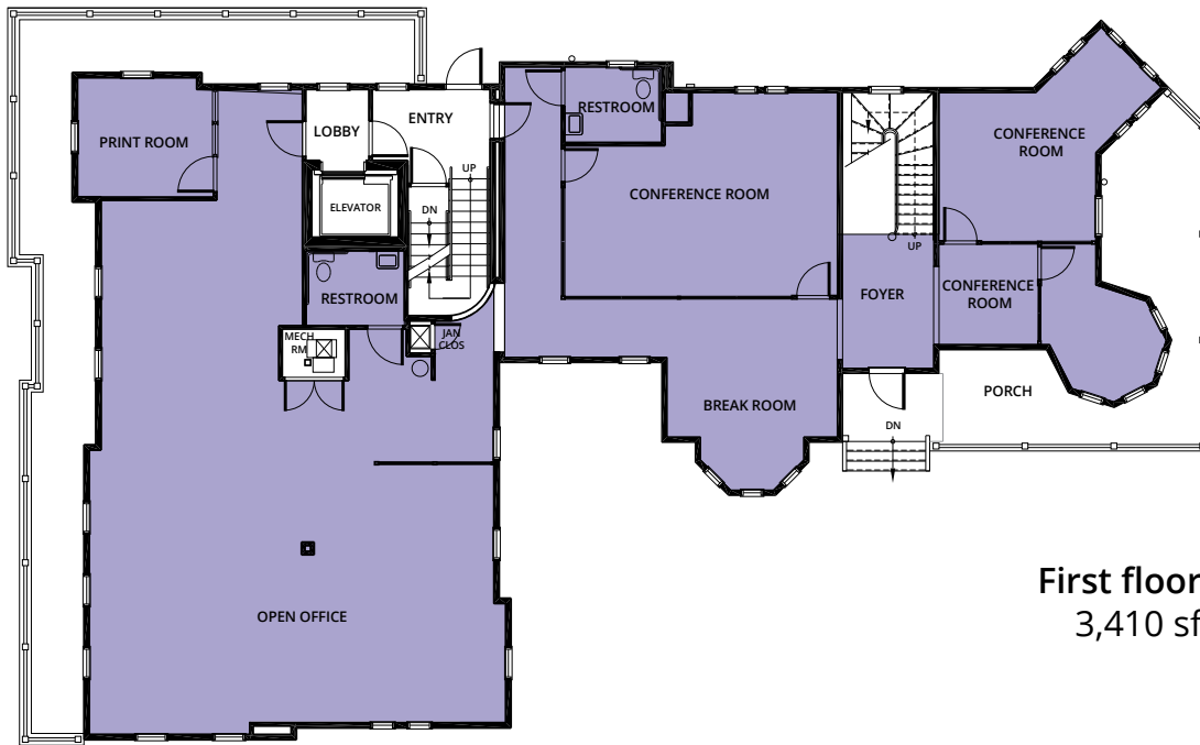
First floor 3,410 sf