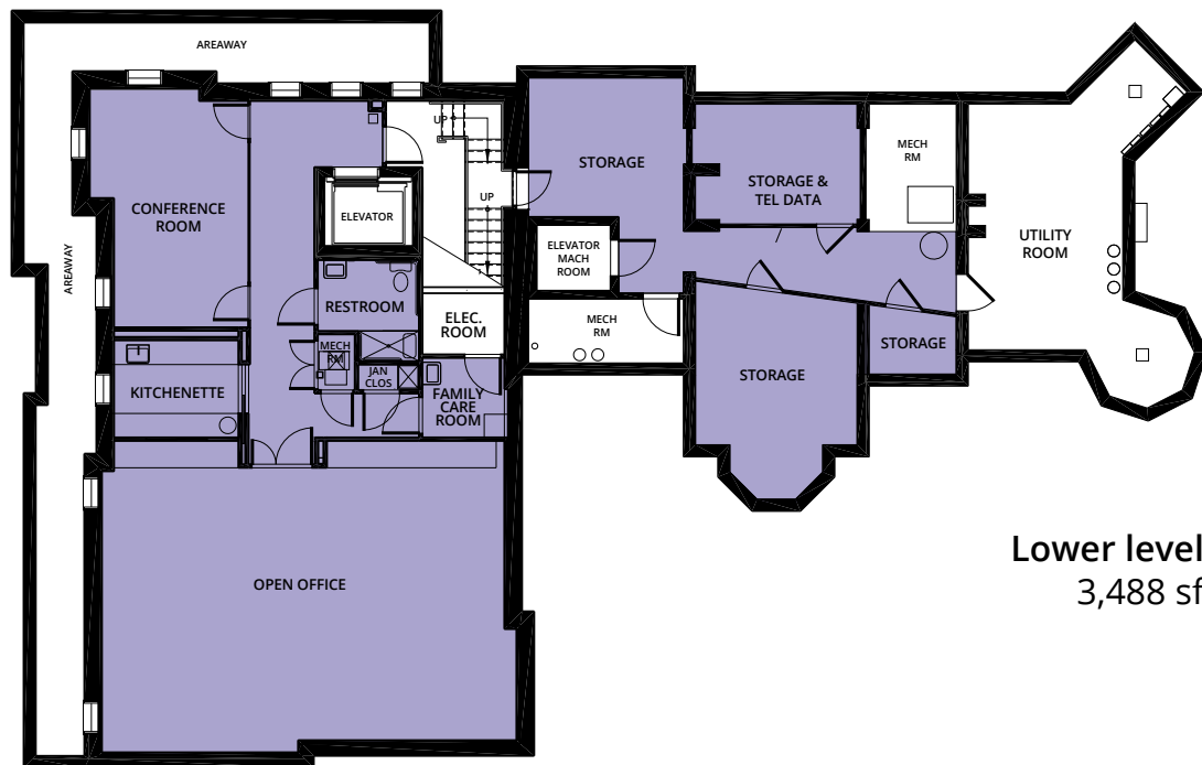
Lower level 3,488 sf