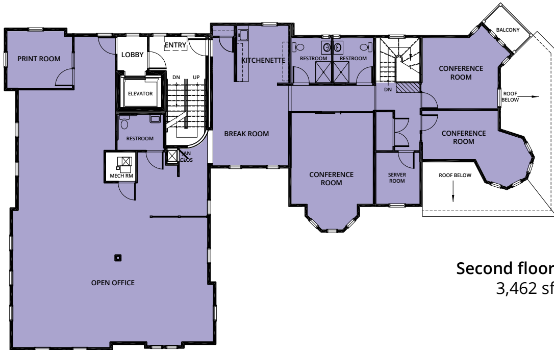
Second floor 3,462 sf