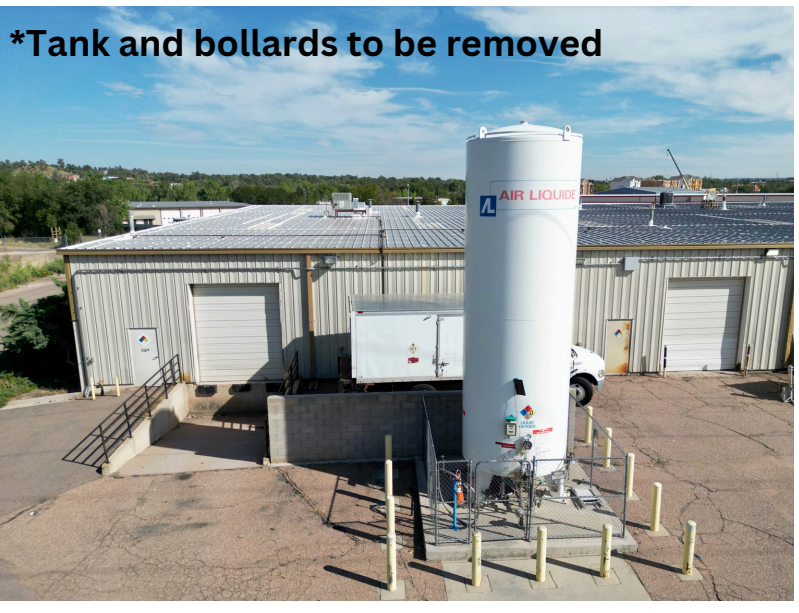
*Tank and bollards to be removed