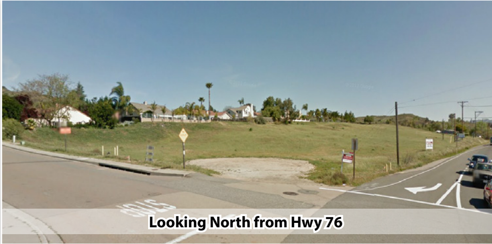
Looking North from Hwy 76