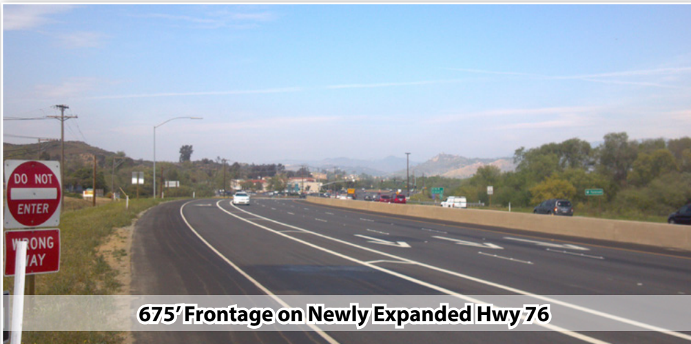
675' Frontage on Newly Expanded Hwy 76