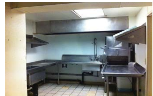
Dish Washing Area