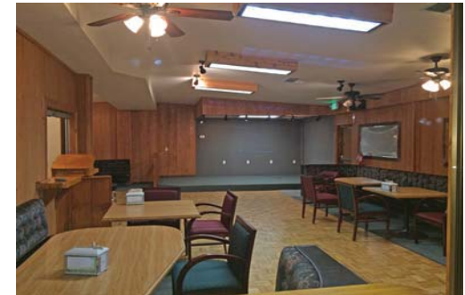
Banquet Room - Dance Floor - Stage