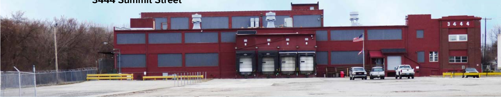
3444 Summit Street