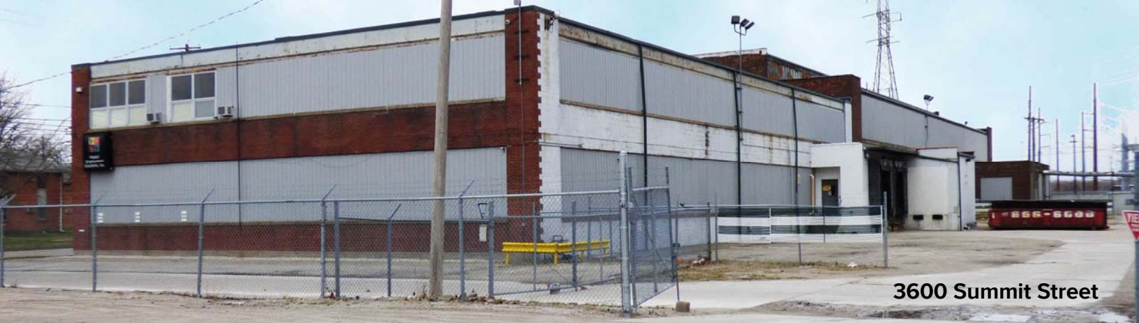
3600 Summit Street