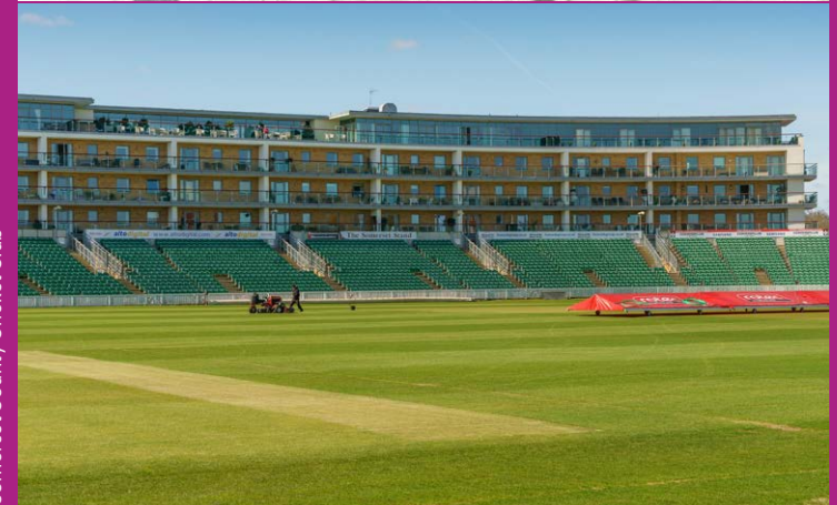
Somerset County Cricket Club