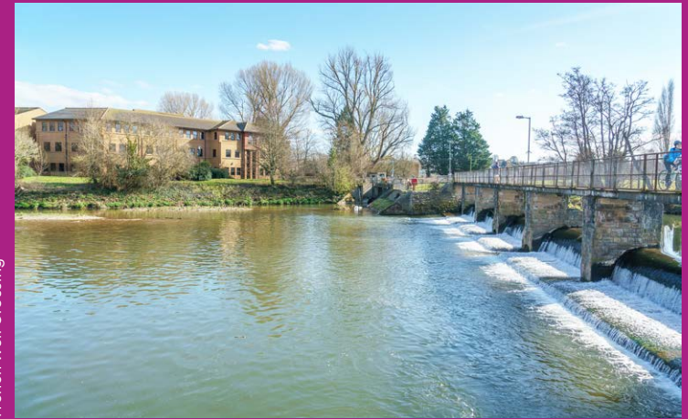
French Weir Crossing