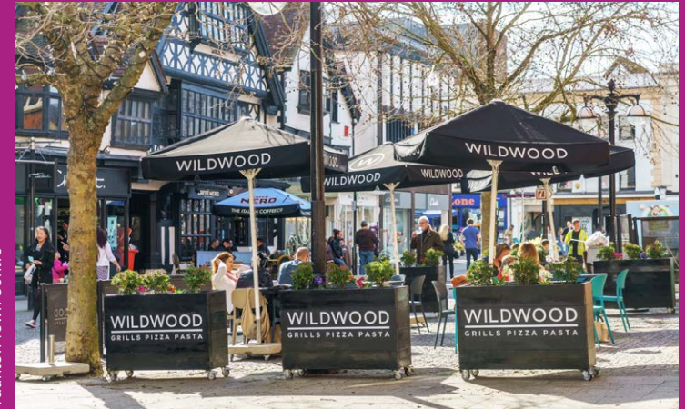
Taunton Town Centre