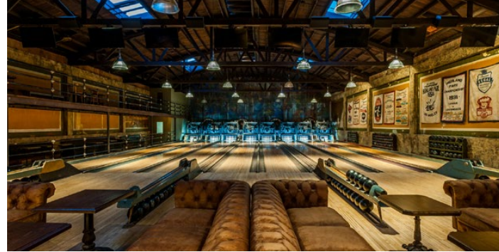
Highland Park bowl. Hip, antique-filled spot for bowling, live music, craft cocktails, pizzas, salads & seasonal fare. [Neighboring tenant in the building]