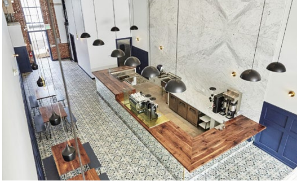
Civil Coffee. Bright, airy cafe offering craft coffee, espresso & pastries, plus light breakfast & lunch fare. [Neighboring tenant in the building]