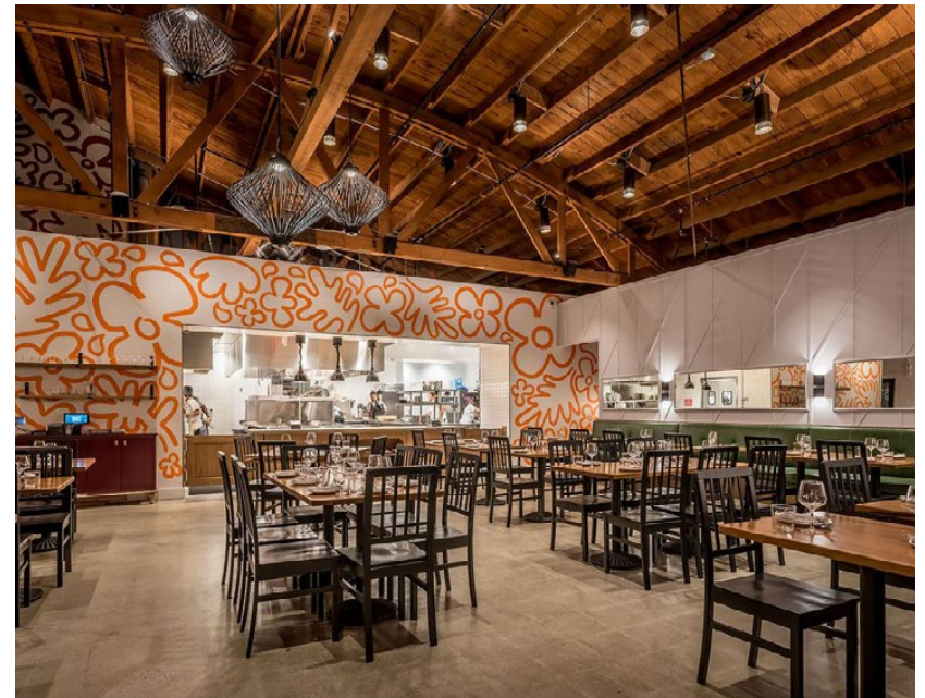
Hippo. Contemporary American & Italian fare from an open kitchen with wine & cocktails in artful environs.