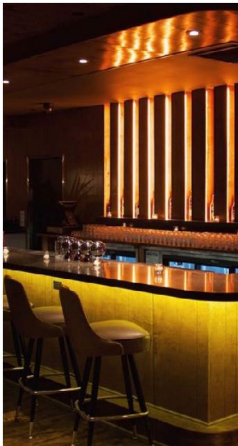
Blind Barber. Hidden behind a barber shop, this lounge offers craft cocktails & modern pub bites in a hip setting.