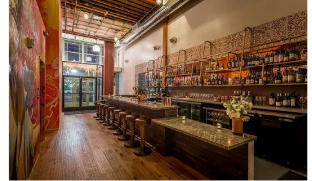
Otoño. A menu featuring elevated Spanish cuisine in a rustic space with dim lighting & a lively bar.