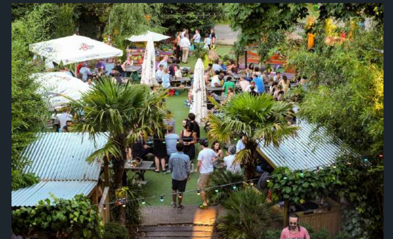
PEOPLE'S PARK TAVERN