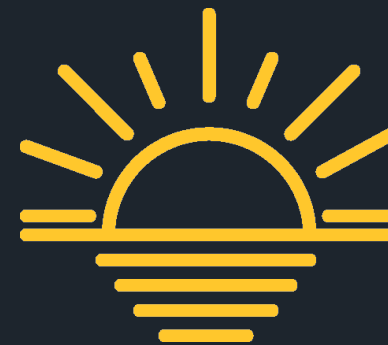
PLENTY OF NATURAL LIGHT