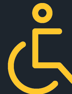
MULTIPLE ACCESS POINTS