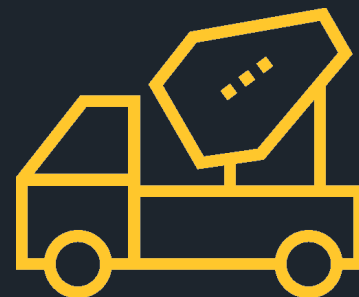
POLISHED CONCRETE FLOOR