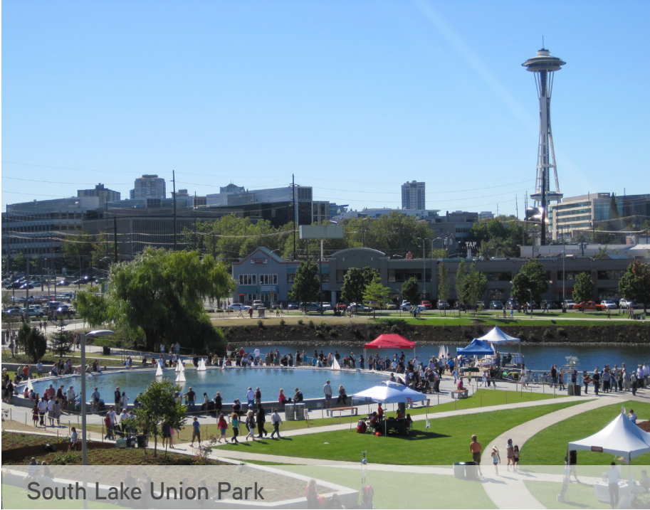
South Lake Union Park