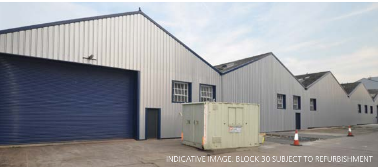
INDICATIVE IMAGE: BLOCK 30 SUBJECT TO REFURBISHMENT