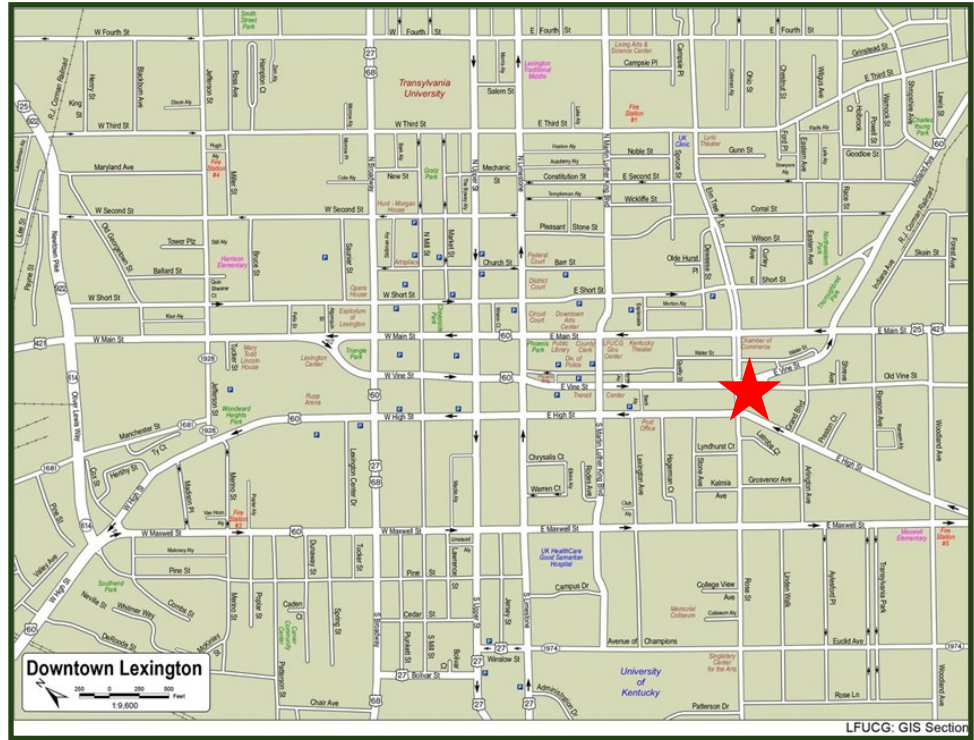
NEARBY RESTAURANT, RETAIL AND HOTEL HIGHLIGHTS