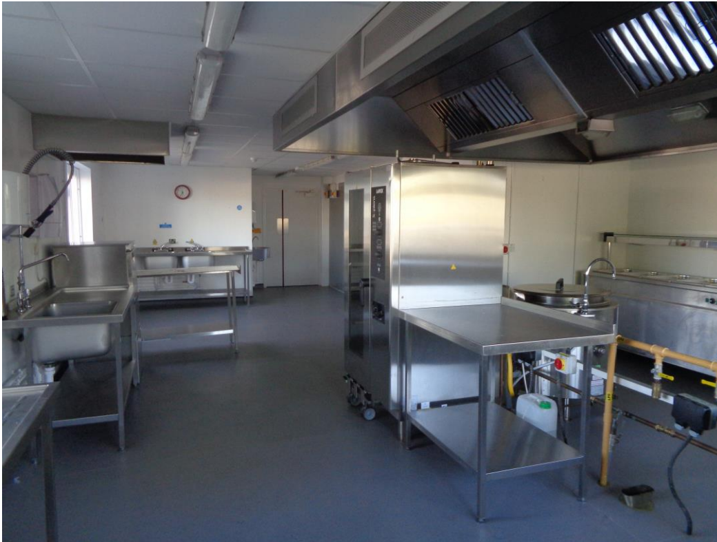
Food Preparation Area