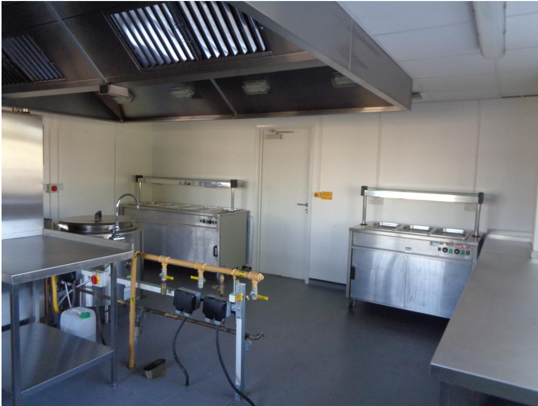
Food Preparation Area

Important Notice – These particulars do not constitute any offer or contract and although they are believed to be correct their accuracy cannot be guaranteed and they are expressly excluded from any contract.