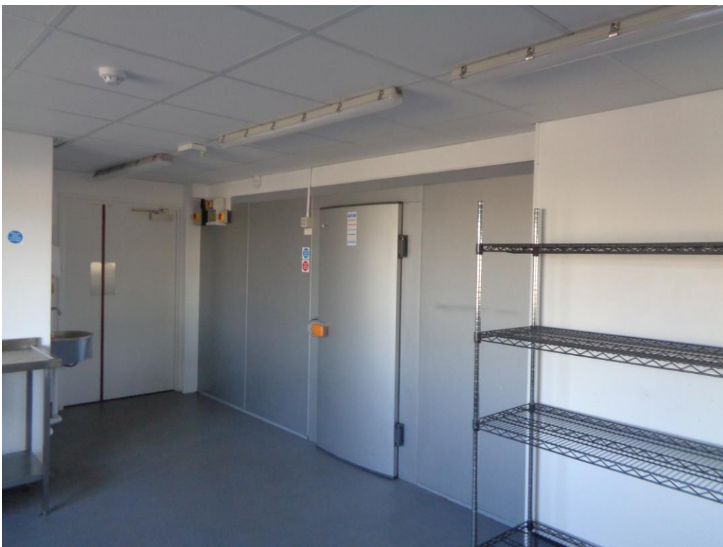
Walk in fridge

Important Note - The particulars do not constitute any offer or contract and although they are believed to be correct their accuracy cannot be guaranteed and they are expressly excluded from any contract