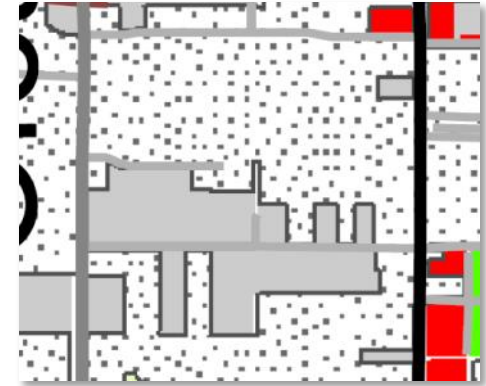
IL, Industrial Light