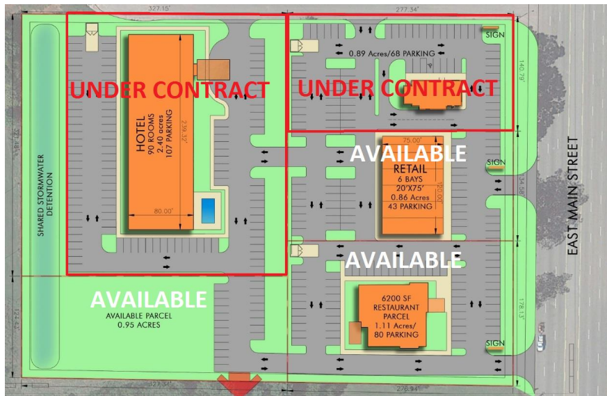
CONCEPTUAL SITE PLAN CURB CUTS TO BE DETERMINED BY SCDOT

BRAND NEW RETAIL CENTER COMING SOON TO HWY 290 IN DUNCAN, SC