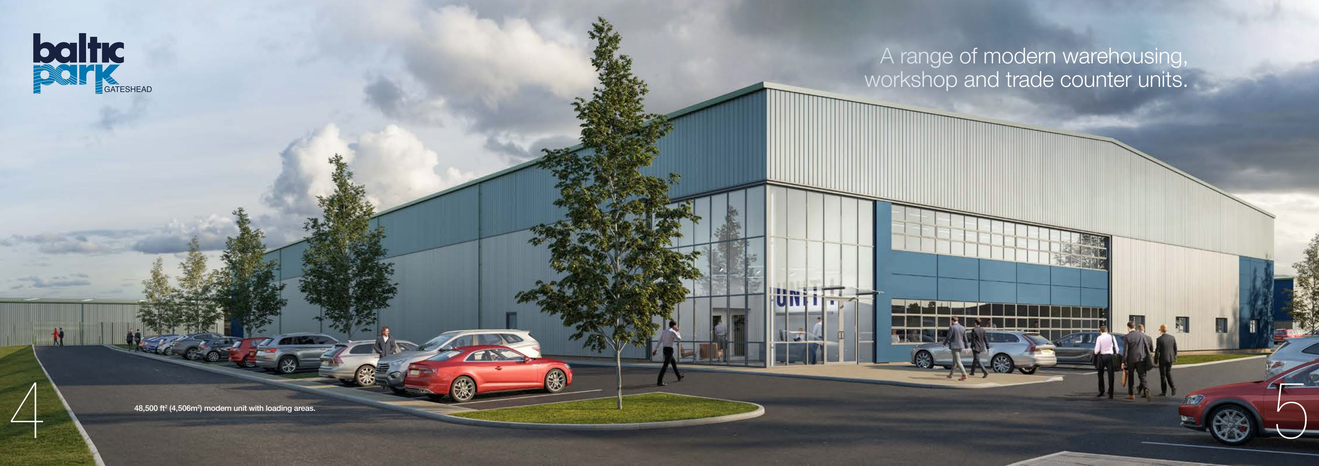
48,500 ft 2 (4,506m 2 ) modern unit with loading areas.

A range of modern warehousing, workshop and trade counter units.