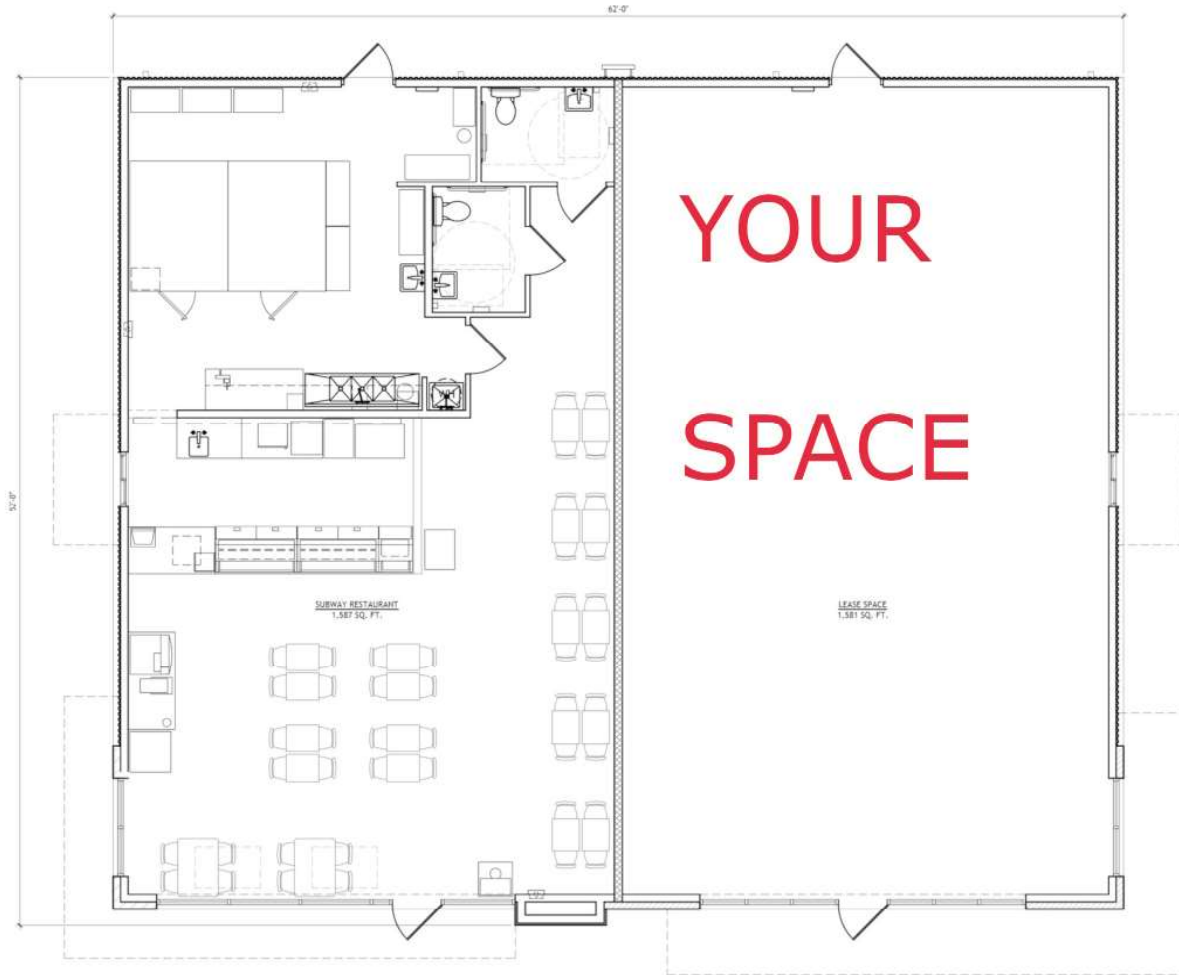
1 FLOOR PLAN 1/4" = 1'-0" SUBWAY = 1,587 SQ. FT. LEASE SPACE = 1,581 SQ. FT. TOTAL = 3,168 SQ. FT.