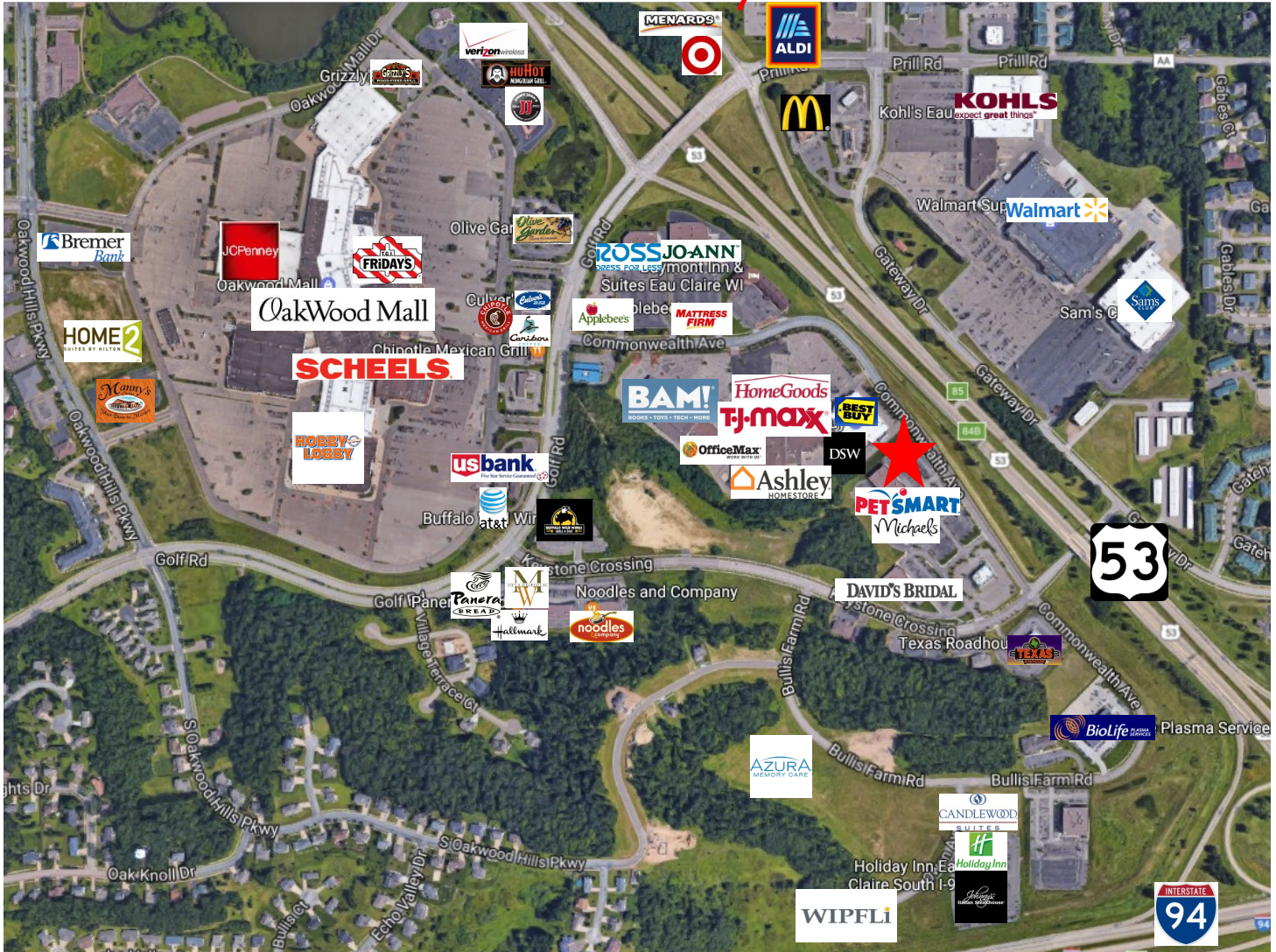
Google Maps, 2017