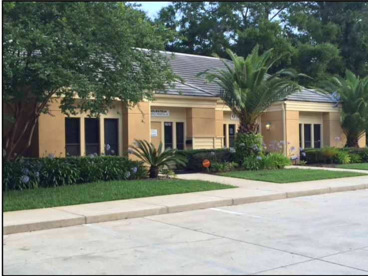
PHOTO GALLERY 3753-1 & 3753-2 CARDINAL POINT DRIVE JACKSONVILLE, FLORIDA 32257