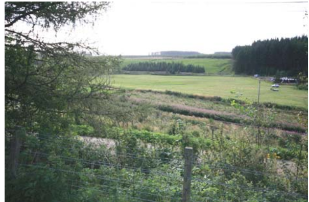
View from Plot 2 over surrounding countryside