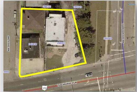
All Dimensions are approximate and not guaranteed, and property is subject to prior disposition.