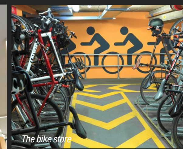
The bike store