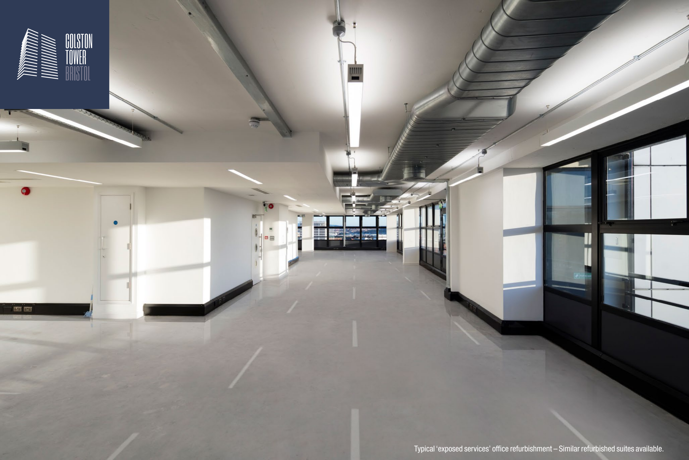
Typical 'exposed services' office refurbishment – Similar refurbished suites available.