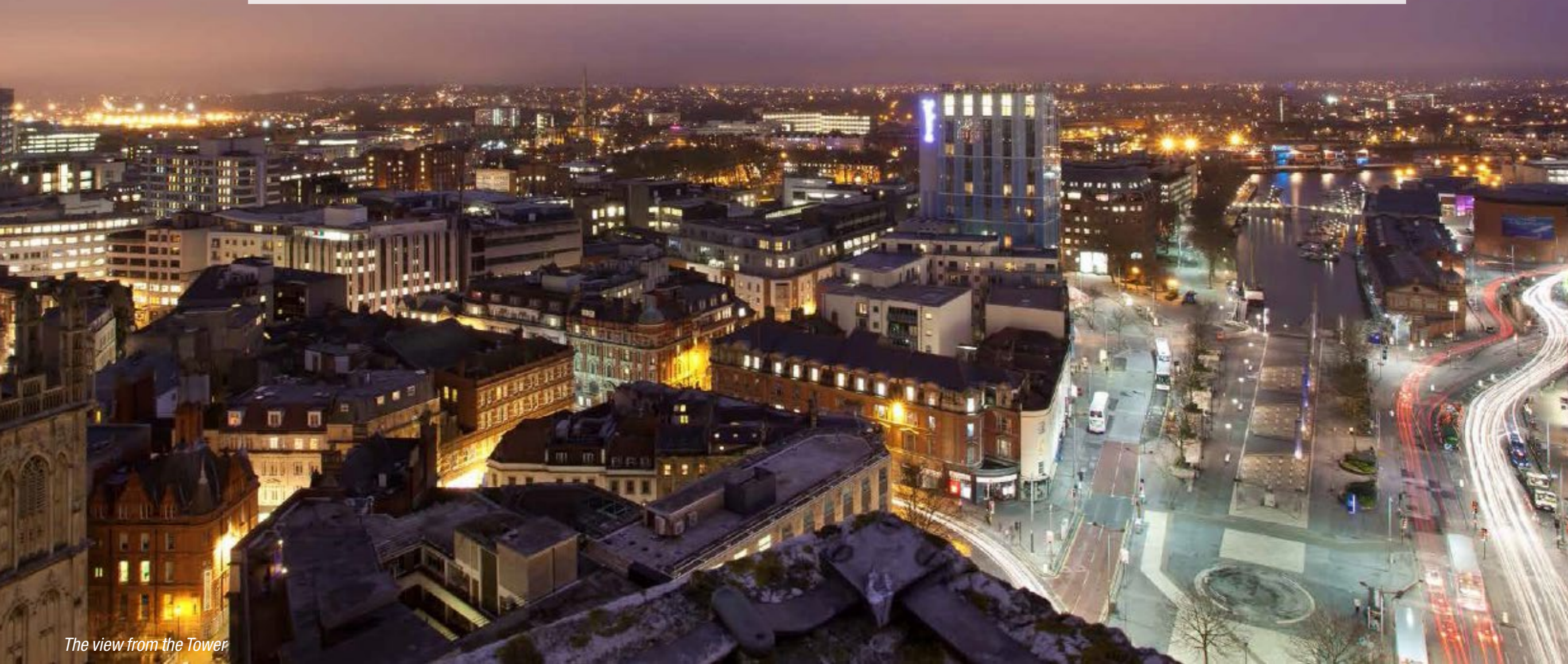
The view from the Tower