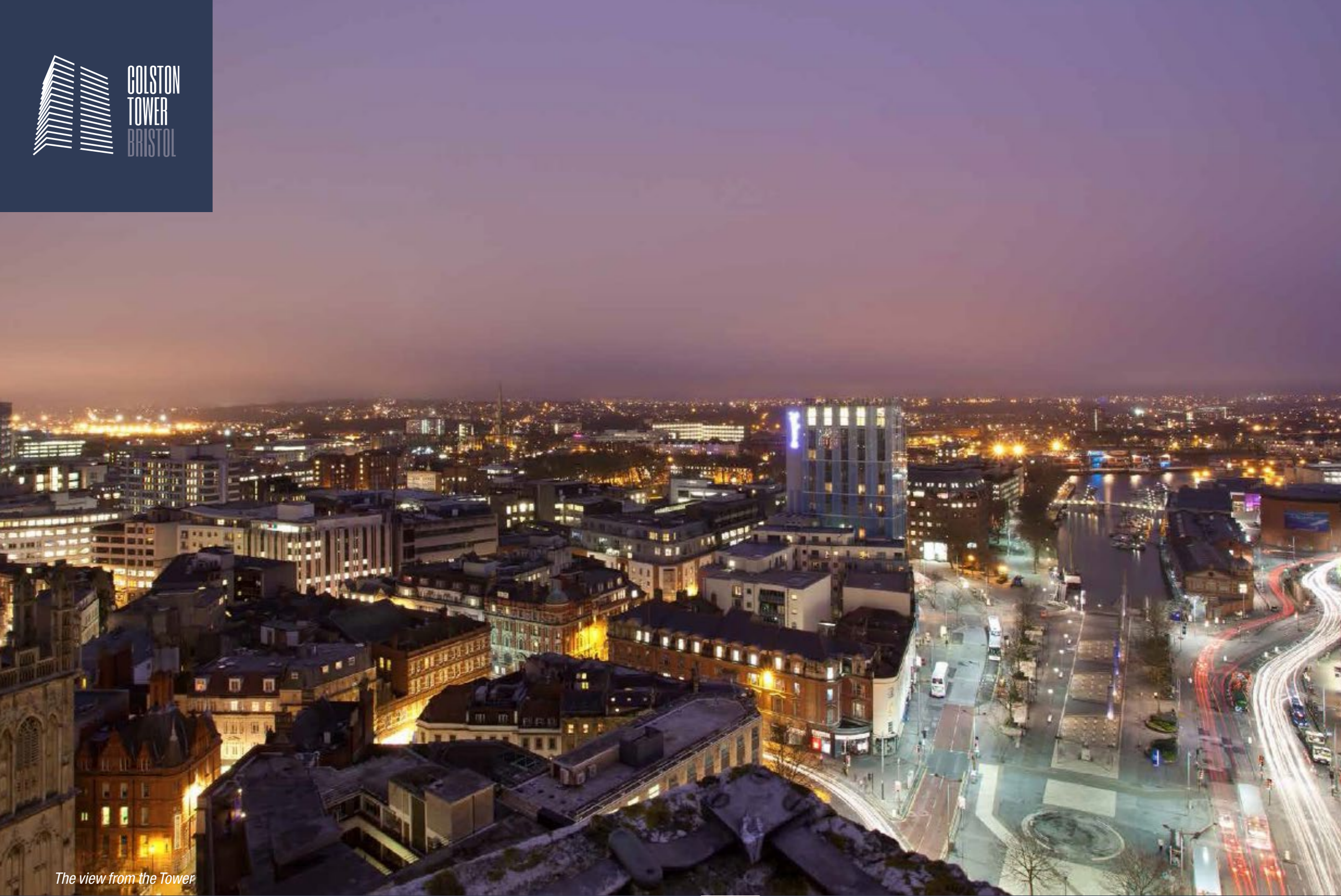
The view from the Tower