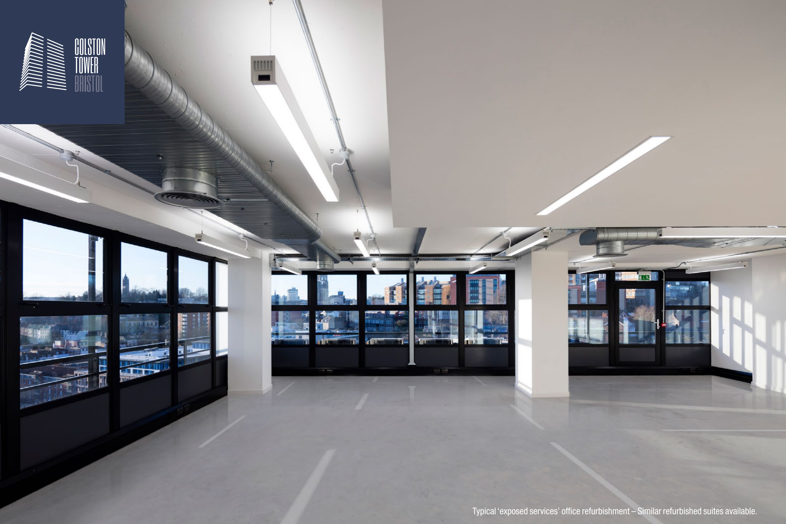
Typical 'exposed services' office refurbishment – Similar refurbished suites available.