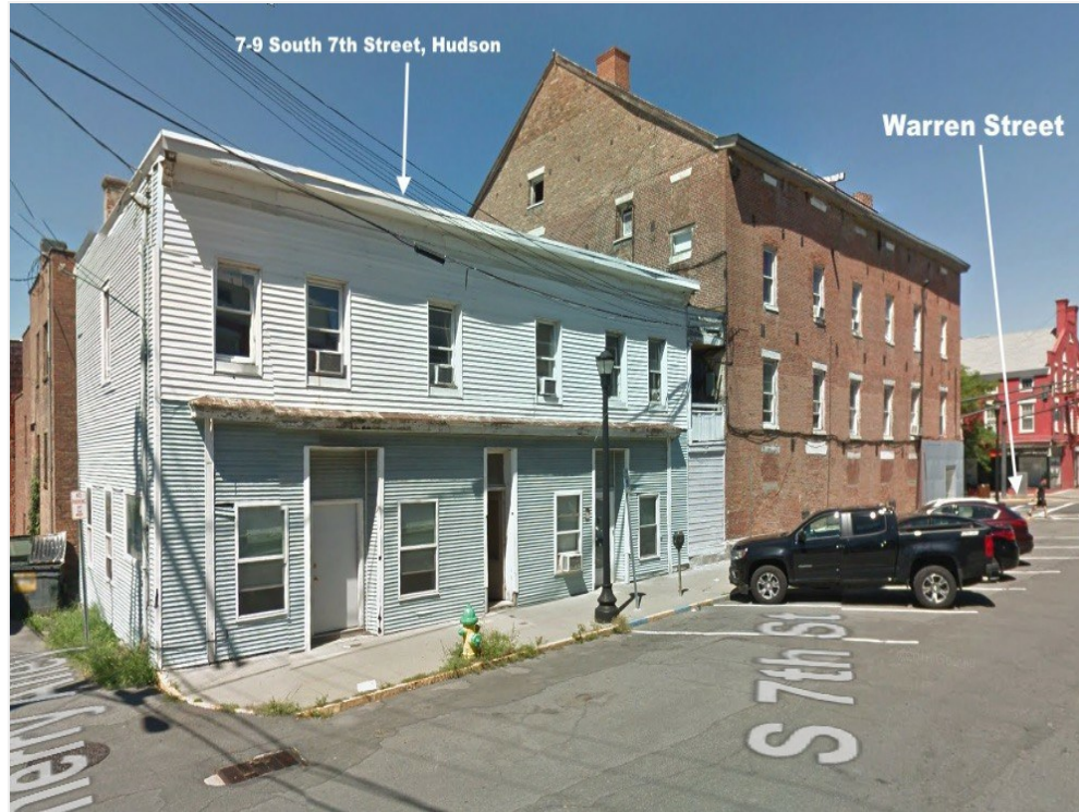
7-9 South 7th St Toward Warren St