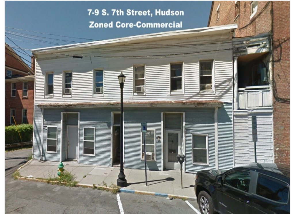
7-9 South 7th St