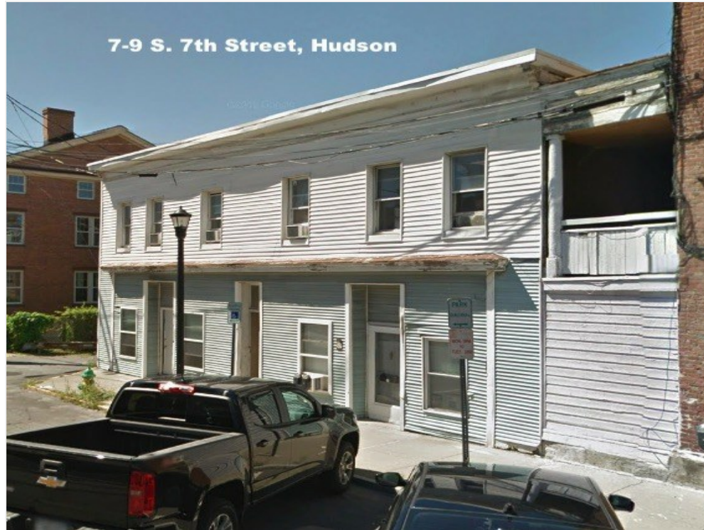
7-9 South 7th St