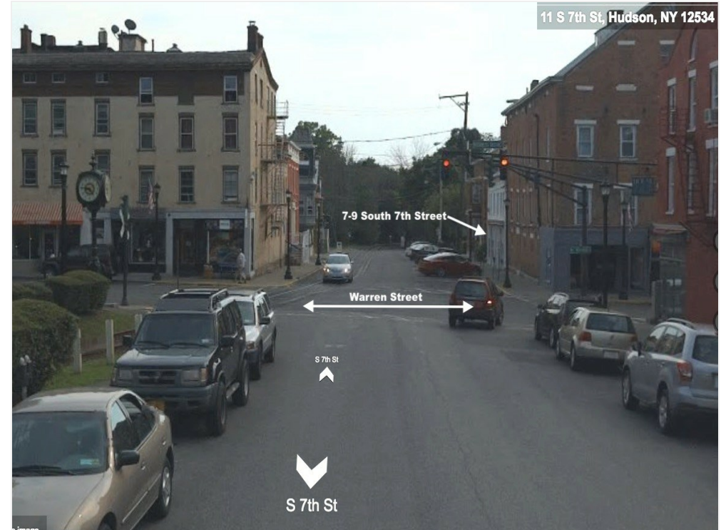
South 7th Street from North 7th