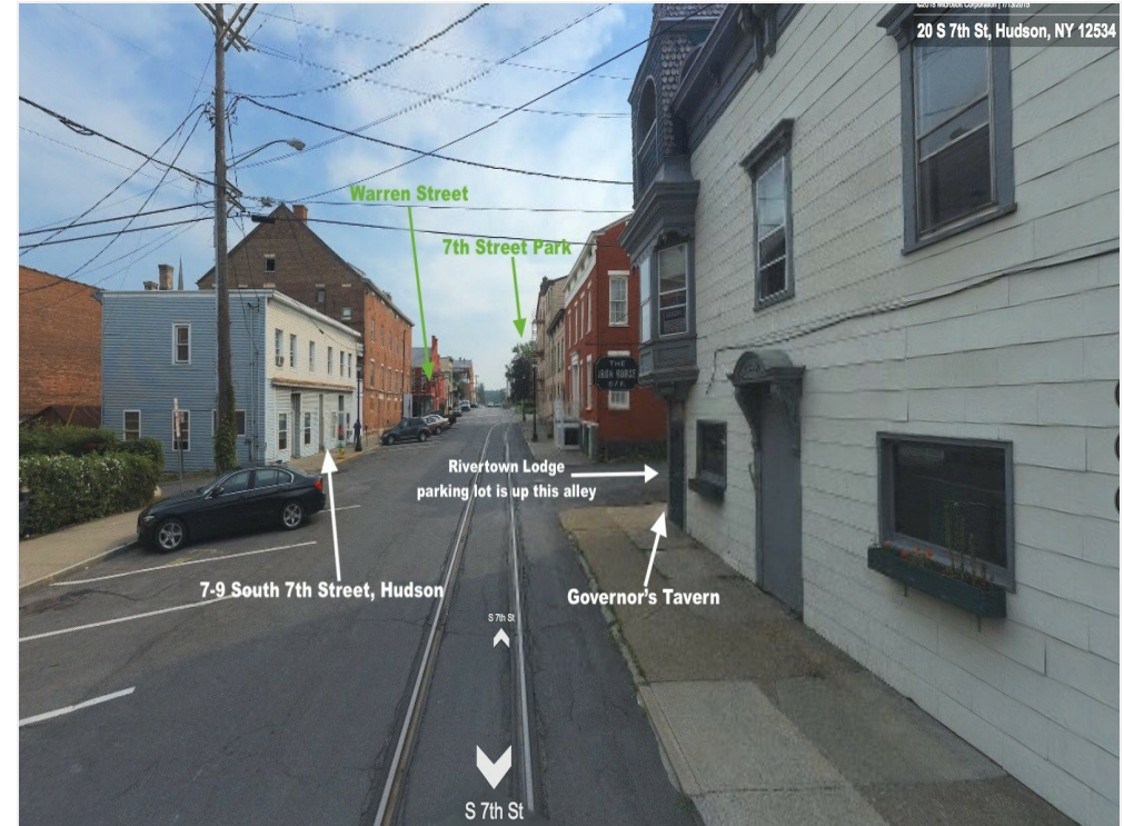
South 7th St Toward Warren St