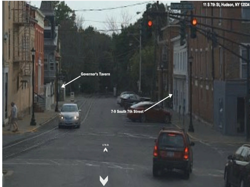
7th St From Warren St