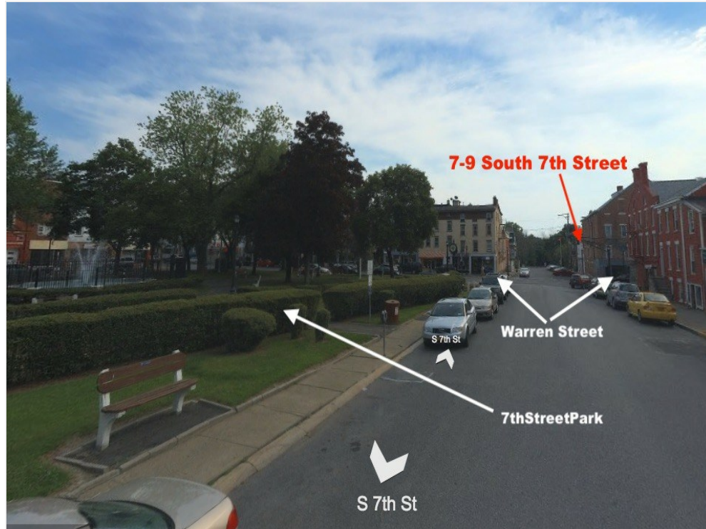
7th St From the Public Square (7th St Park)