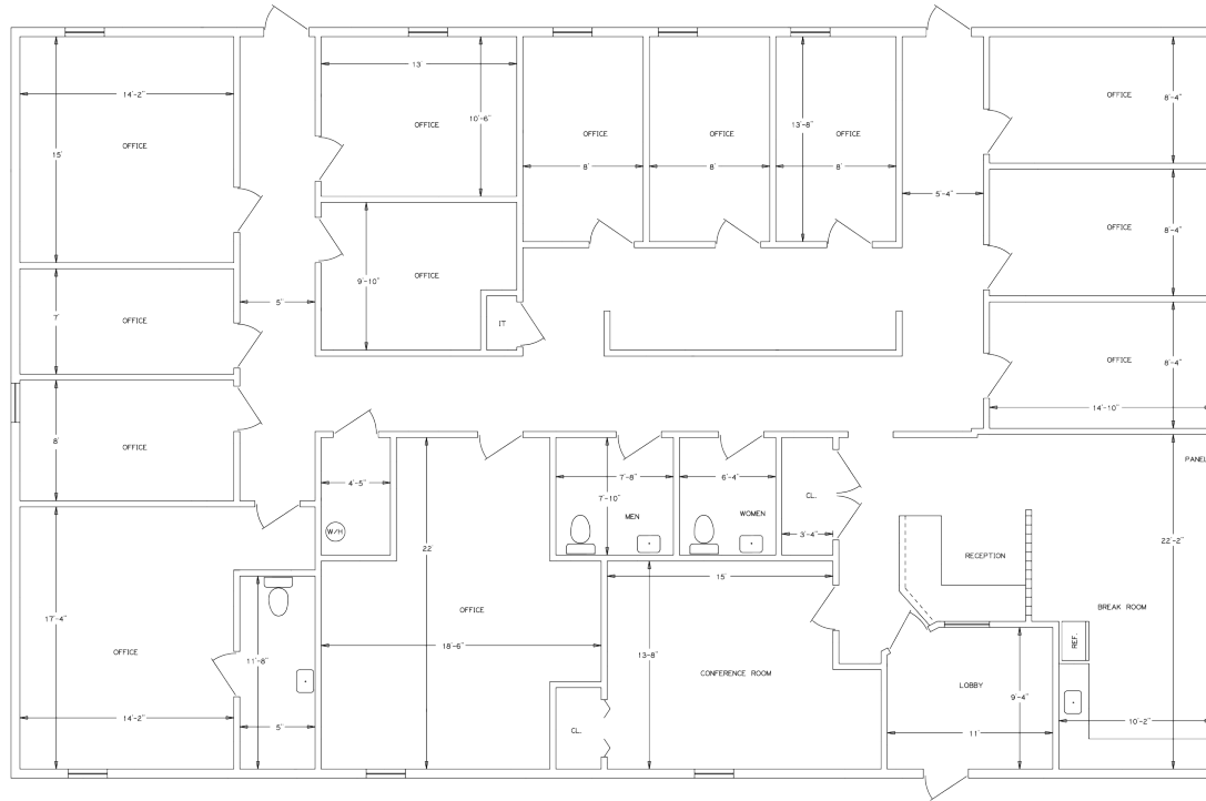
EXISTING FLOOR PLAN

1814 HOLLY ROAD | CORPUS CHRISTI, TX 78417