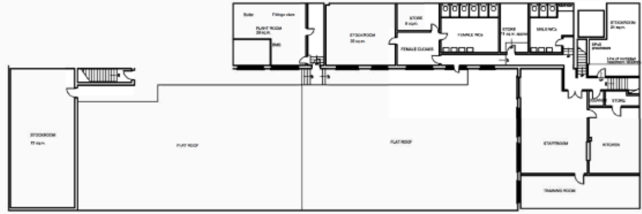
AS EXISTING FIRST FLOOR GENERAL ARRANGEMENT SCALE 1:100