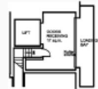
AS EXISTING SECOND FLOOR GENERAL ARRANGEMENT SCALE 1:100