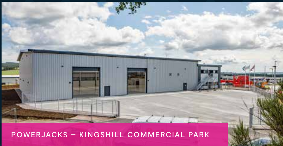
POWERJACKS – KINGSHILL COMMERCIAL PARK