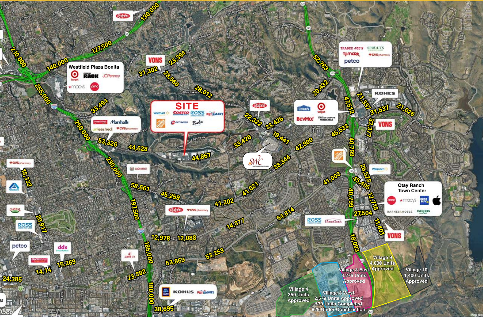
2024 City of Chula Vista Traffic Counts