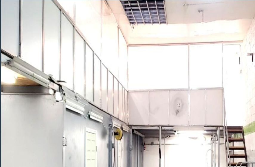
INTERIOR — MEZZANINE + GROUND LEVEL | Skylights Visible